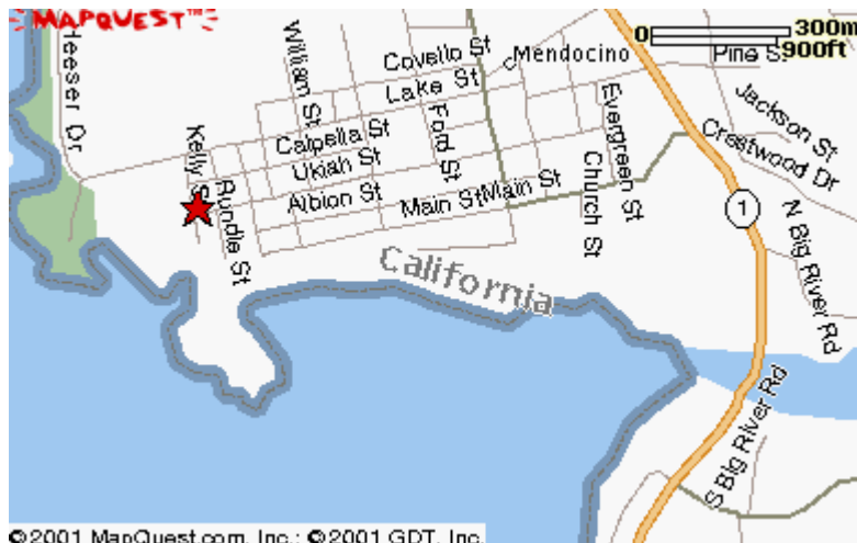
Map of Mendocino -- the red star is the house.

Take Hwy 101 N. Exit at Hwy 128 West to coast. Take Hwy 1 North to Mendocino. Once you reach Mendocino, take a Left on Main St. (at the stop light). Make a Right on Lansing. Left on Ukiah. Go to the end of the street. Make a Right on Kelly. It is the house immediately to your right on the corner of Ukiah and Kelly. Address is 10531 Kelly.