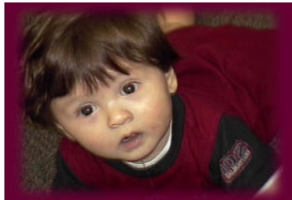
Kaii just doesn't understand why these adults are acting this way